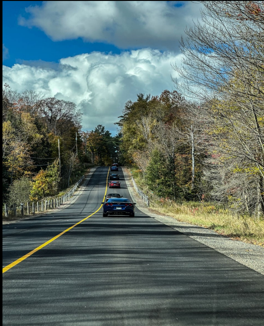
Corvette Club of Ontario

A CCO cruise is a gathering of Corvette enthusiasts who drive together along a predetermined route, with designated stops, and enjoy the company of fellow Corvette lovers.